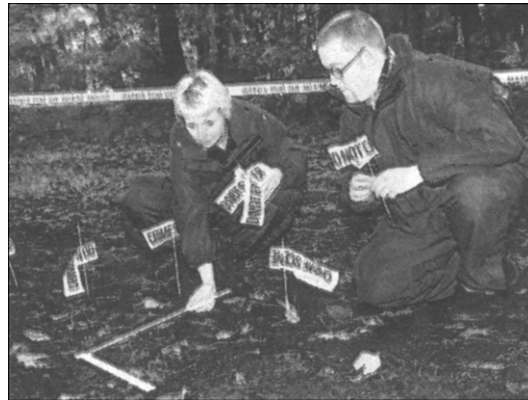
Police officers at work

F OR the first time, a British police force is being taught to use traditional native tracking skills to catch housebreakers, thieves and murderers.