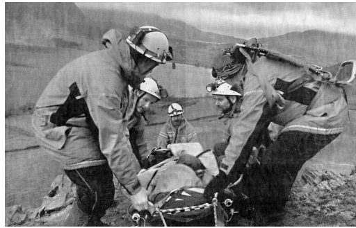
In action: mountain rescuers in the Lake District

Summer is the busiest season for the volunteers who save those stranded in the mountains. Tony Durrant reports