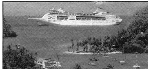
IDYLLIC: Grown-ups will love it on Arcadia

But parents needn't worry. The vast majority of P&O cruises will still warmly